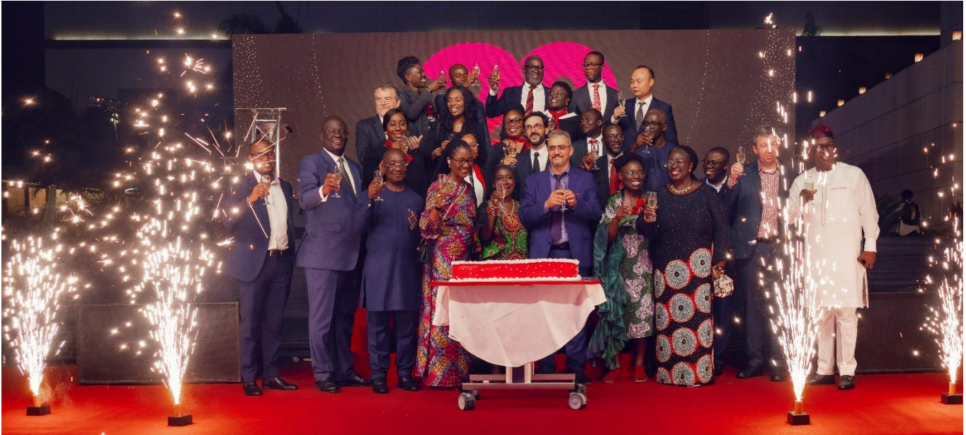
Figure 1: Some of the Bank's Board of Directors, Management and Customers cutting the 20 th Anniversary Cake

Accra - Ghana, Thursday 5 th October, 2023